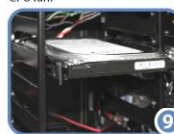
Screwless HDD track-To assemble HDD easily.