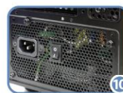
PSU in the bottom-Keeps chassis not only steady, without shaking, but also provide better air flow for PSU.