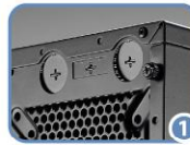
Support water-cooling pipe.