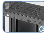
Top ventilation opening.