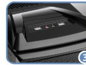
I/O module on the top of bezel-Users can more easily access to USB or AUDIO port.