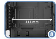
Support 313mm VGA card.