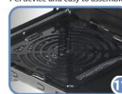
PSU dust prevention net-To prevent dust from entering the PSU.