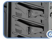
Screwless ODD-To assemble ODD easily.