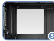
Don't need to remove the motherboard off when changing CPU fan.