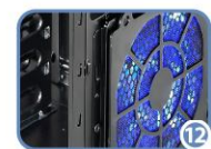
Front dust filter-To prevent dust from entering case (Optional). Can assemble 9, 12, 14cm fan.